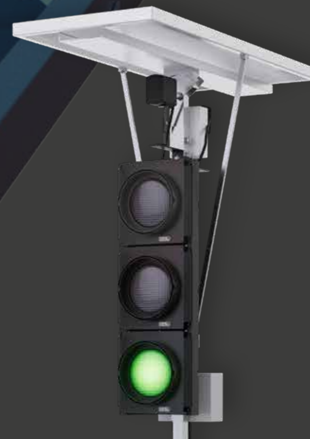
Asset Battery Voltage TM290

Maintenance is incredibly low thanks to the efficient solar system - an occasional panel clean is all that's needed to keep SolarLight™ operating at peak performance. Removing leaves and dirt, where possible, helps to improve the efficiency of the panels.